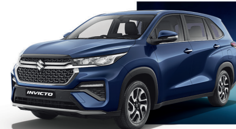
NEXA BLUE (CELESTIAL)