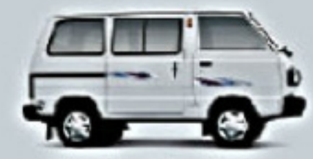
Metallic Silky Silver