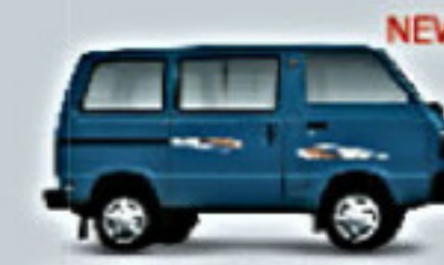
Metallic Pearl Blue Blaze