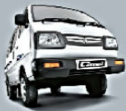
OMNI 5 SEATER