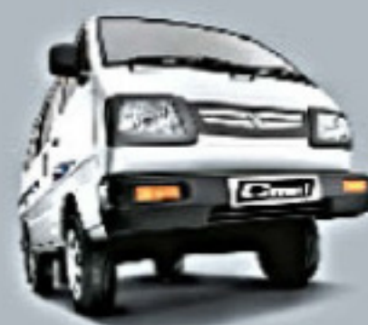
OMNI E 8 SEATER